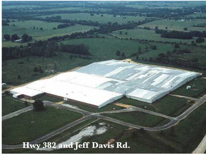
Hwy 382 and Jeff Davis Rd.